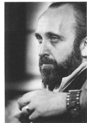
2. Jerome Rothenberg.