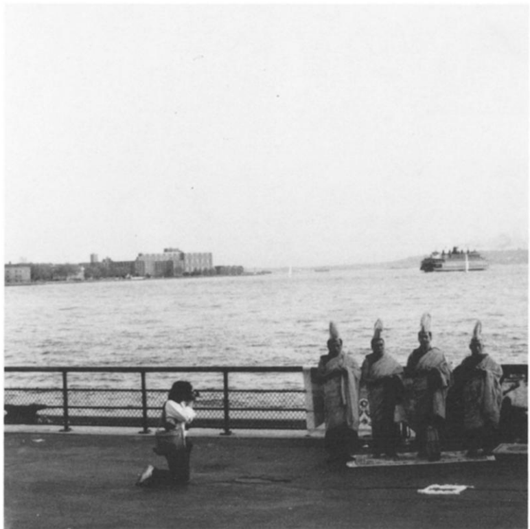
3. In this 1989 concert in New York harbor, Tibetan monks' horns were echoed by boat and harbor horns.