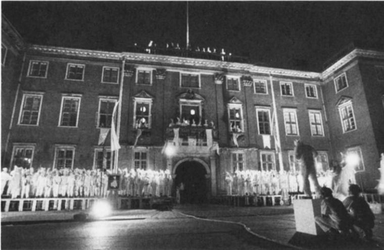
7. Whether megalomania or love of crowds, Morrow's pieces have encompassed ever larger arenas. Citywave Copenhagen, 1985, involved a city and 2,000 performers.

Wave for 60 clarinets and a boat, and eventually Toot 'n' Blink for a harbor of boats working their lights and horns. And there were conch orchestras marching in parades. The conch is such an extraordinary outdoor instrument. It became associated with peace events. I got interested in conches and ocarinas because they were easily learned by nonmusicians and they worked well outdoors. As a public eventmaker I wanted instruments that could be played in a sophisticated way by people with little musical chops.